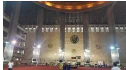
Figure 5 Interior of the Main Hall of Istiqlal Mosque covered by domes roof