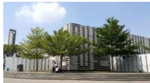
Figure 13 Exterior of Al-Irsyad Mosque