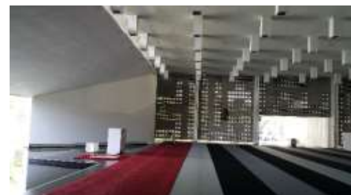
Figure 14 Interior of the Main Hall of the Al-Irsyad Mosque covered by flat roof