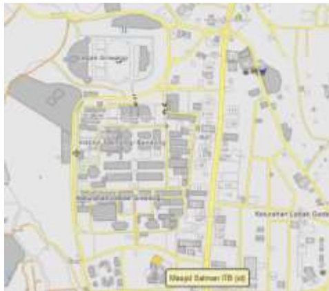
Figure 6 Location of Salman Mosque: ITB Bandung [Wikimapia, 2019]

Salman Mosque is a campus mosque, which is part of the ITB (Institut Teknologi Bandung) campus. The mosque, covering an area of around 7500 m 2 and has a capacity of around 2000 people. The architecture of the Salman Mosque is not only a breakthrough but also unique. Unlike other mosques in Indonesia in the early 1970s, this mosque started the trend of mosque architecture without a dome, with a flat roof. The form of the mosque is really like a cube. On the front yard (southern), there is a minaret that is not so high, formed like a menhir; at the top, there is a loudspeaker [Figure 6,7,8].