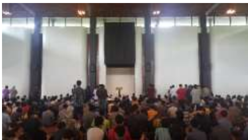
Figure 8 Interior of the Main Hall of Salman Mosque covered by flat roof

For someone who has never visited before, it will not be easy to find the Salman Mosque. Even though it has a minaret, the mosque complex is still not visible from a