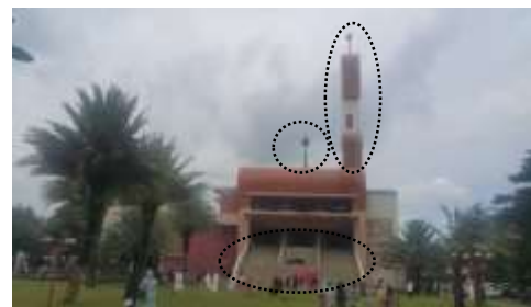
Figure 10 Exterior of Bani Umar Mosque