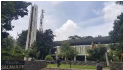
Figure 7 Exterior of Salman Mosque