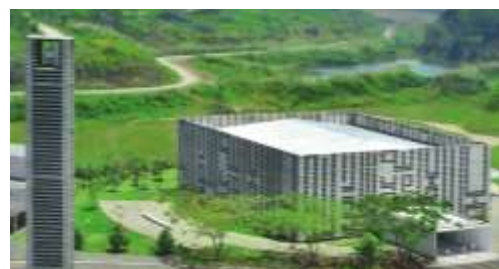
Figure 15 Exterior of Al-Irsyad Mosque