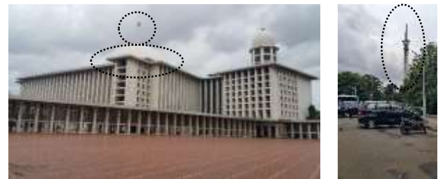
Figure 4 Exterior of Istiqlal Mosque (left) and Minaret (right)