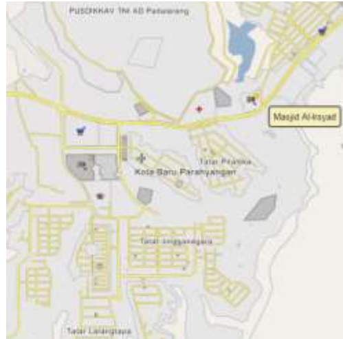
Figure 12 Location of Al-Irsyad Mosque: Kota Baru Parahyangan, Bandung [Wikimapia, 2019]

The Al-Irsyad Mosque was built on an area of 1 Ha, which became an inseparable unity with the Al-Irsyad Satya Islamic School (affiliated with the Al-Irsyad Al-Islamiyah Boarding School of Singapore) an international Islamic school in Kota Baru Parahyangan. The mosque building can accommodate 1500 worshipers—the mosque is in the form of a simple cube. In one corner of the yard, there is a minaret that is not so high, in the form of a square cross-section. At the top, there is a mini globe. From the outside, a flat-roofed mosque can be seen; when, in fact, the mosque roofed the form of a kampung whose slope is very gentle and is covered by walls around the building. So that the mosque looks flat at the top. [Figure 12,13,14,15].