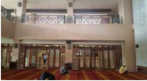
Figure 11 Interior of the Main Hall of Bani Umar Mosque covered by flat roof

Within the scope of the surrounding environment, the minaret of the Bani Umar Mosque is visible; it is a sign that there is a building that functions as a mosque. This sign is reinforced by the Arabic word Allah on the top of the minaret. The Arabic word Allah made of a metal plate is also found on the roof of the mosque, which is relatively flat.