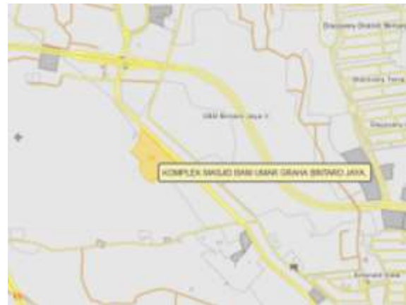
Figure 9 Location of Bani Umar Mosque: Bintaro, South Tangerang [Wikimapia, 2019]

The Bani Umar Mosque is a mosque of the pride of the people of Tangerang. Like the Salman Mosque, the Bani Umar Mosque does not have a dome roof. This mosque can accommodate around 1600 worshippers. At the rear (western), there is a minaret as high as 50 meters. The form of the minaret is a square, tall, and slim. At the top of the minaret, there is an Arabic word of Allah, which made of a metal plate. [Figure 9, 10, 11].