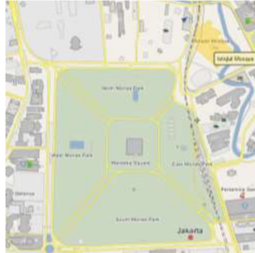
Figure 3 Location of Istiqlal Mosque: Central Jakarta [Wikimapia, 2019]

In this case, the minaret and the metal crescent plate, which is on the dome's roof, are sacred signs. Furthermore, the form of the half ball dome roof covering the main hall of the mosque is a sacred form.