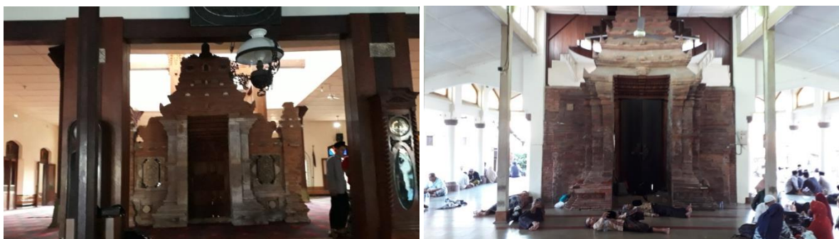
Figure 2 Twin Gate in the mosque (left) and on the porch (right)

Figure 1 shows the crowds of pilgrims and tourists who come around Menara Kudus both day and night. The mosque is open 24 hours so free pilgrims come at any time. The crowd of pilgrims occurs throughout the year, even in the month of Ramadan even though pilgrims keep coming to Menara Kudus Mosque. The pilgrims came in groups, some using tourist buses, elves, and cars. Sunan Kudus built the Menara Mosque when it was named Loaram which was converted into Al-Manar or Al-Aqsa Mosque, which mimicked the name of the mosque in Palestine. The year of the construction the tower written in a Javanese-style chronicle reads the Rusak Ewahing Jagat Gate: which means in 1609 J / 1687 M. Ancient objects in the mosque are several gates (Twin gates, Padureksan gate, Mosque side gate and Tajug gate), Padasan, and Tajug. The mosque was established in 956 H / 1549 M with the name Masjid Al-Manar or Al Aqsa [4].