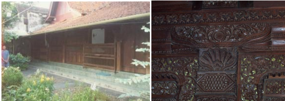
Figure 3 Kudus Traditional House

Kudus traditional house is a building that has a simple arrangement of spaces. The core building consists of jogosatru, gedongan, and pawon rooms. In essence, the Pawon room is a space with the nature of casual activities. The number of pawon rooms in a Kudus traditional house is at least one piece, a maximum of two pieces. Located in front of the Pawon room, there are wells and bathrooms. There is a Kudus traditional house that is equipped with a gutter which is used as a cooking place. Jogosatru is a public space and is used to receive guests. Gedongan is a private space used for beds and storing valuables. Kudus traditional house is unique not only in its shape but also because of the many carvings contained in it. Gedongan room is divided into 3 rooms, all of which are given a limitation in the form of very complicated carvings, especially in the middle part of the room. In some Kudus traditional houses there are other complementary elements such as buildings for businesses called the Sisir building.