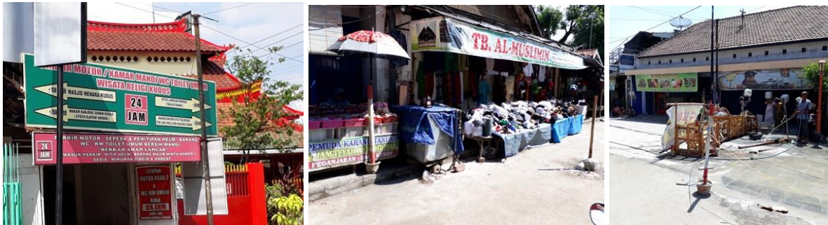
Figure 4 The economy around Menara Kudus

When the cigarette trade began to decline, the economy emerged that was associated with pilgrimage and tourism activities in historic buildings is the existence of shops that sell equipment for pilgrims, souvenirs, food, convection and souvenirs typical of Kudus. In addition to shops, there are also houses that rent out part of their places for overnight stays and bathrooms. The pilgrims came for pilgrimage not only to Kudus. Often the pilgrims came from the pilgrimage in Demak and headed for the pilgrimage to Tuban, Ampel, Cirebon, or other cities where Walisongo was buried. That's why they can come at midnight, noon, or morning. The pilgrimage inn is actually just a room for bathing, changing clothes and taking a break.