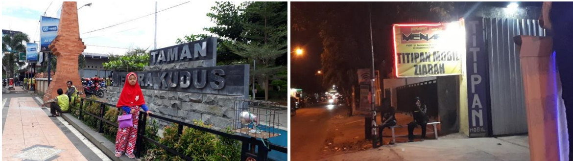
Figure 5 Arrangement of Menara Kudus Park (left) and the pilgrim's car (right)

Initially, in front of the Hok Ling Bio temple, it was used for the old Kudus square and the transportation base in the direction of the Menara. The pilgrim vehicles can still park freely along the road to Menara Kudus. Over time this causes congestion because that's what RTBL planned (Building and Environmental Planning) of Menara Kudus.