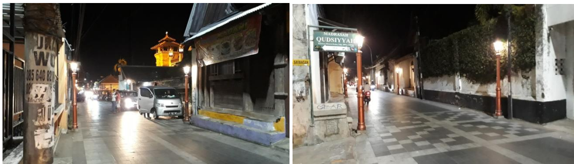
Figure 6 The road around Menara Kudus after being revitalized

The Kudus Regency Government has made efforts to revitalize Menara Kudus area while maintaining the building elements that are used as markers in the area of Menara Kudus. For example, when a revitalization effort was made on the old square, the base of the vehicle and the parking lot was moved but still maintained the banyan tree and was used as a hardscape element in the Menara Menara Park. After moving the public transport base, the government provides motorcycle taxi, tourist rickshaw, and transportation as a mode of transportation that connects between the Menara Menara area and the pilgrim's vehicle parking lot. After the government moved the houses and shops between the old Tower of the old square, then a shop was built in front of the Hok Ling Bio temple which was more organized and had a passage through Menara Kudus. The description above proves that there is influence between historical buildings in the area of the Menara Menara and economic development and arrangement of the surrounding area.