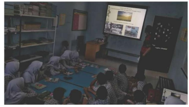
Fig. 3. The teacher presents the problem situation through video clips

because the turn of the night and day had been there for as long as the sunrise had been timed and could not be changed by humans, the teacher justified his answer. Then the teacher explains the meaning of qodo and qodar.