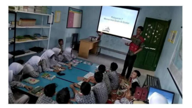
Fig. 2. The teacher begins learning

Phase 1 Gain attention and explain the inquiry process To get students' attention, the teacher starts learning by motivating students so that they are actively involved during learning activities through doing joint brain gymnastics. The teacher explains the learning objectives about the meaning of qodo and qodar, differences in qodo and qodar, the relationship between qodo and qodar, as well as examples of qodo and qodar in human life through visualization images, such as death, one's birth, and others.