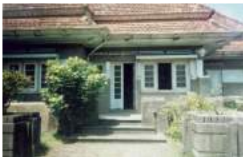
Figure 3 : Gedong House

The owner of the gedong house is usually a cigarette entrepreneur on a larger scale than the cigarette entrepreneur who is in the traditional Kudus house. The cigarette factory will be located separately from its home environment because the cigarette production process was still manual and involved many employees, starting from the tobacco mixing department, rolling the tobacco to the packaging process, and ready for distribution. At that time, various jobs were known, such as grinding, vanity, cutting, etc., all of which were related to turning tobacco into cigarettes that were ready to be marketed.