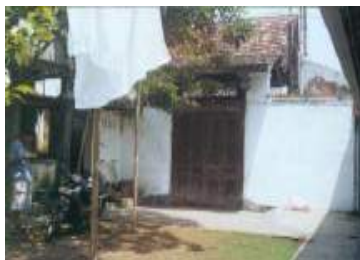
Figure 5: Kilungan House