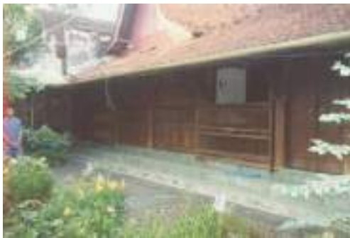
Figure 1: Kudus Traditional House

The previous discussion explained that 3 vernacular dwellings can still be traced in the Old City of Kudus, namely the Kudus traditional house, the gedong house, and the kilungan house. The three houses have several buildings which are part of the completeness of the house.