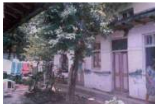
Figure 2: Sisir Building

In the traditional Kudus house, in front of the main building there is a sisir building, which is a building used as a place of business. Initially, the business that occupied this sisir building was the secondary food trade during the Dutch colonial period. This trade then developed when the cigarette industry entered the Old City of Kudus, these traders also turned to tobacco trading and producing cigarettes. In the 1900s, there was a boom in the trade of tobacco and home industry cigarettes in the Old City of Kudus, which were processed in sisir buildings.