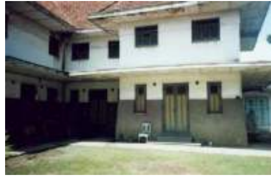
Figure 4: Warehouse at Gedong House

The completeness of the gedong house apart from the main building is a building related to business, namely warehouses and offices. The warehouse in question is a tobacco warehouse as material to be processed. The warehouse in this gedong house is part of the warehouse and the other part is integrated with the factory. While the office in question is the office to take care of the administration of the cigarette factory.