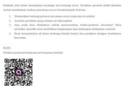
Fig. 3. Videos and Interactive quiz at each end of the material started when the QR code is touched

One of the types of viruses discussed in this E-book is HIV (Human Immunodeficiency Virus) that causes AIDS (Acquired Immune Deficiency Syndrome), which is a collection of symptoms of damage to the immune system. This topic is related to puberty that occurs much in the younger (premature) age in various parts of the world, including Indonesia. However, pubertal education has not been the norm, especially at elementary school level [7]. The intended education should be designed so that adolescent friendly [6,8] and sensitive culture [6,9] to complement the discussion in the class.