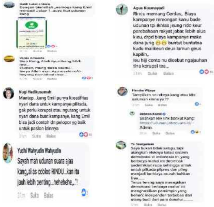
FIGURE 2: COMMENT OF FACEBOOK USER