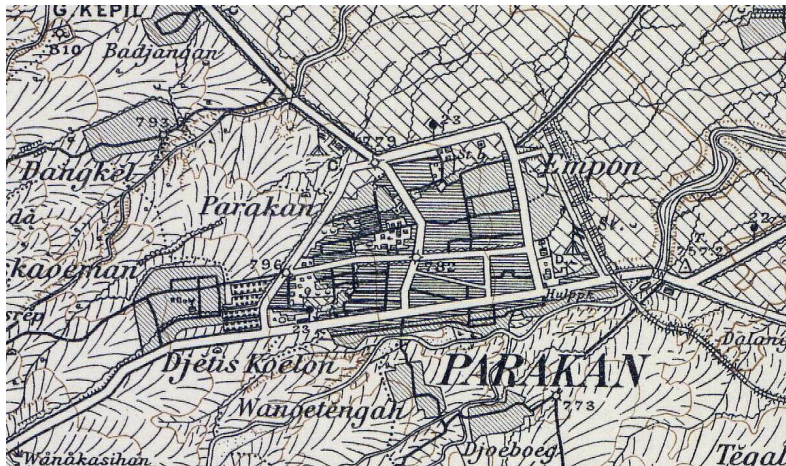
Figure 3. Map of Parakan in the Colonial Period (19th - 20th century)

culture of Parakan, which was known as the City of the Bamboo Runcing. The local community is very proud of the bamboo runcing and its history. It was introduced to Indonesian soldiers by the religionist K.H. Subkhi and became the traditional weapon of Indonesia. This historical aspect has led to emotional bonding and affection for this hero as a pioneer of the Bamboo Runcing. All members of the community of Parakan, whether native Indonesians, the Chinese community or “pendherek” or followers of Pangeran Diponegoro and their great-grand-children, have this historical attachment.