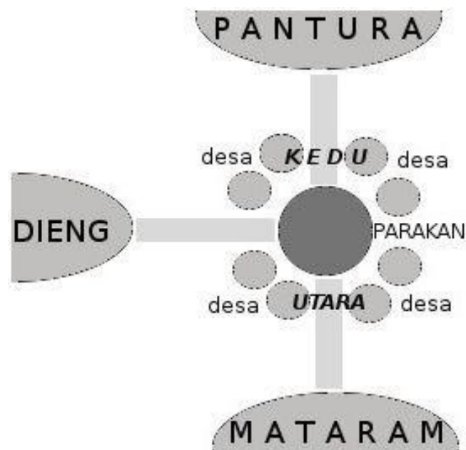
Figure 1. Location of Parakan in Central Java

Over time, Parakan has experienced significant physical and economic decline compared with surrounding cities. Its local government has been encouraged to restore it to its former glory through tourism by promoting its historical and cultural values. One of the most significant activities from the local community in collaboration with local government has been to propose Parakan as a heritage city, and the memorandum of understanding to this effect was declared and signed on 10 th December 2015 by Bupati Temanggung and the Minister of Pekerjaan, Umum dan Perumahan Rakyat.