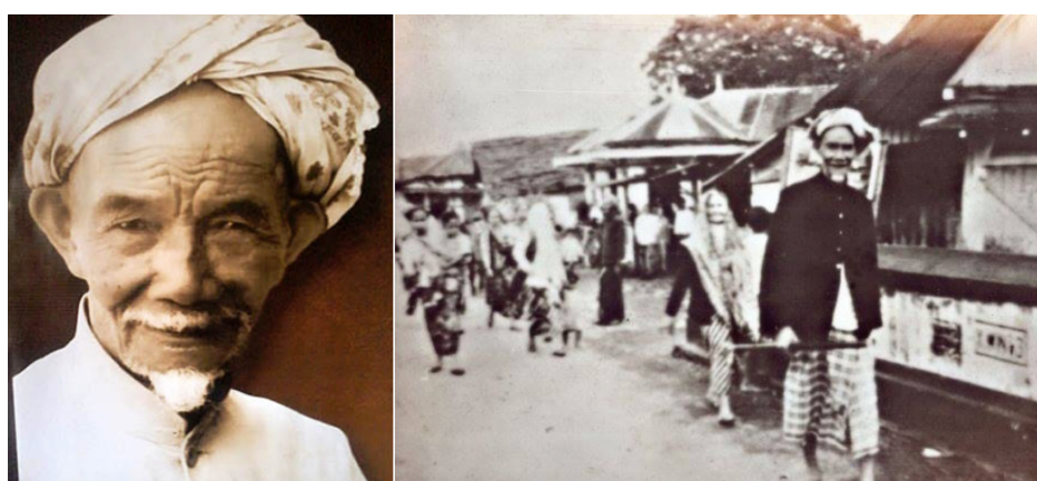
Figure 6a and 6b. The religionist and pioneer of the Bamboo Runcing, K.H. Subkhi, Kyai Bambu Runcing, National Hero of Indonesia and son of one of the soldiers of Pangeran Diponegoro.