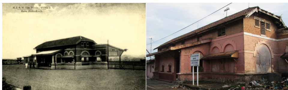
Figure 5a and 5b. Condition of the Railway Station in Parakan in the Colonial and Post-Colonial Periods. Source: https://jejakbocahilang.wordpress.com/2016/10/28/parakan-kota-pusaka-di-temanggung-jawa-tengah/ , accessed 12 th March 2017