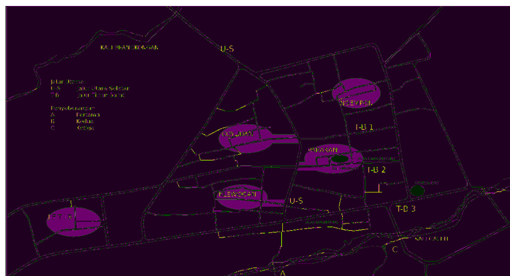
Figure 2. Map of Parakan

The designation of Parakan as a heritage city is not based solely on the existence of historical buildings within the area as tangible heritage sites, but also on the value of its tradition and culture as forms of intangible heritage. One valuable artefact that has existed since the colonial era is the bamboo runcing: a traditional weapon used by Indonesian soldiers in the colonial era. It has become a significant object in the history and