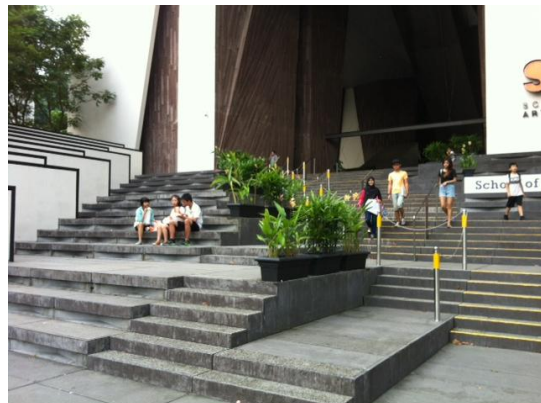
Figure 8: There are steps at pedestrian area of SOTA which could be functioned as a facility for interaction, socializing between students to relax or just sitting around with friends.

The above figure 7 shows that pedestrian area at SOTA is quite spacious to accommodate the need of open space for campus area. Public users or public pedestrian who have been regarded not as users within campus (academic community): lecturers, students, academic staffs could also enjoy the comfort of pedestrian area of SOTA.