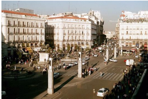
Figure 1: Puerta del Sol: one of an example of public open space in Classic City Madrid. The main function is as a place for meeting point.

space without anything, while open space has been defined as a place for surrounding communities to do some activities and interaction freely within it. .