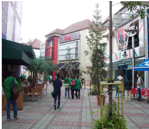
Figure 4: Cihampelas Walk: one of example of space between buildings which has been used as facilities for windows shopping, walking around or just enjoying the atmosphere by sitting at cafes within this open space.

Public space is a significant requirement in a city planning. Classic towns had used urban open space as a place to meet, interact, gathering either for religious purpose, trade or to develop government.