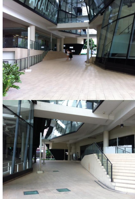
Figure 11 and 12: those figures show the area of pedestrian within campus area of Lassale. This pedestrian area is heading to enter inside the campus area. The using of material on the floor giving a comfortable feeling for the users. Some parts of the floors have been designed by putting some glasses to give natural light for basement floor.

Lassale shows the differences of the authority between two areas. Those two pedestrian areas have been designed to support each other, thus the differences between two areas will not be a constraint for users either public pedestrian or private pedestrian (academic community).