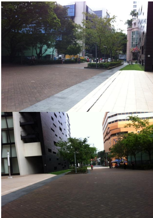
Figure 9 and 10: pedestrian area within campus area of Lassale College of the Arts. Above figure shows pedestrian way in front of Lassale to Bugis Village. And below figure shows pedestrian way from Lassale to Village Hotel Albert Court

The convenience factor for users especially for the campus academic community has to be concerned. Thus, students, lecturers and academic staffs as users of pedestrian area within campus area will enjoy and feel the comfort and the safety in using the facility.