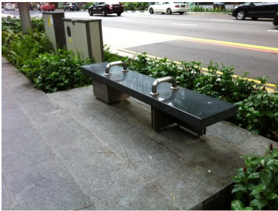
Figure 6: supporting facilities within pedestrian ways, benches and potted plants in Orchard Road, Singapore.