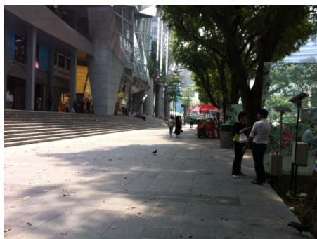
Figure 2: Orchard Road: Pedestrian way in Orchard Road. Comfortable pedestrian way in Singapore, supporting facilities have been applied in this way (benches, big trees, etc)

By grouping these urban planning elements, it has been understood that open space is an important element in the formation of urban architecture. Furthermore, Shirvani had stated that open space can be interpreted as a landscape, hardscape (roads, sidewalks, etc), parks and recreation areas within urban areas. Referring to Shirvani's statement, it is very clear that open space has an important role in urban architecture planning. A city requires public spaces for citizens to interact each other, to seek an entertainment and to do some recreational activities.