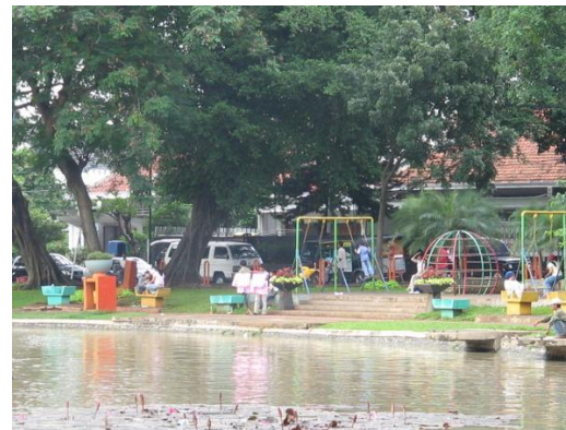
Figure 3: Taman Lembang, Menteng: one of public park in Jakarta. It is located within highclass housing in Menteng. It is a favorite place for teenagers for hangout and enjoying foods surrounding Situ Lembang (Lembang's lake)

According to the above explanation about open space, it has been clarified that open space is no longer has a function just as a public space, but there are many functions which has been transformed become new functions and meanings. These transformation of new functions and meanings have been formed as an impact of the need of surrounding community.