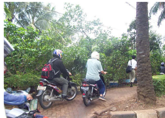
Figure 5: Jalan Raya Ragunan: misapplication of pedestrian way. The pedestrian way has been used by motorcycles to cut their route. There is a pedestrian who tried to pass the pedestrian way which is not safe anymore for him.

The problem turns out to be more complex, because the facilities that should be provided to support the above alternative are quite limited. Many people are complaining about this lack of facilities. Pedestrian ways that have been provided by government to serve the need of pedestrian are not used optimally. There are many pedestrian ways that have been used for other function. One of the misapplication of those pedestrian ways is by using those ways for motorcycles, pedestrian will not use those ways because it is not safe for them anymore.