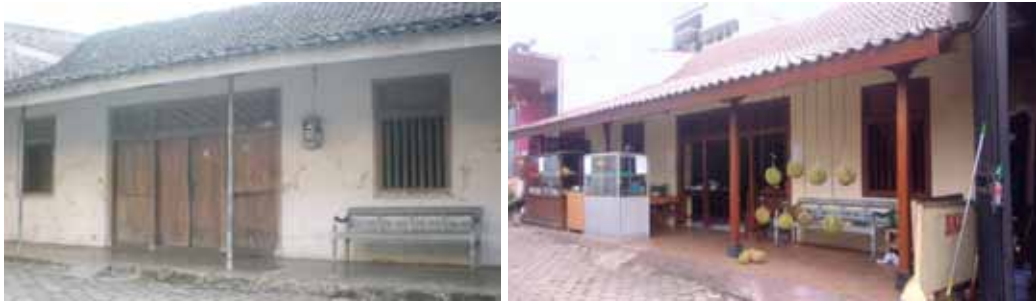
Figure 8. KH Subkhi's House- Left-hand Side: the house during the colonial era before renovation, Right-hand Side: the house in post-colonial era after major renovation, it becomes a restaurant. This house is one historical place from the colonial era and the place of KH Subkhi (the pioneer of Bamboo Runcing) for living and his activities during the colonial time.

had never been open to the public, apart from the middle terrace that used to be for “pengajian” or recitation in groups. After a renovation in 2010 and 2012, it was opened to the public with a restaurant in the front and a residential space at the back. Its form remains the same, with large 4 sectioned doors in the middle of the façade with two adjacent windows.(see Figure 8).