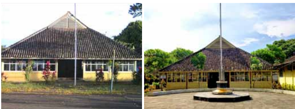
Figure 10. Kawedanan office as one of historical buildings from the colonial era, Left-hand Side: Kawedanan Office in colonial era, Right-hand Side: Kawedanan Office in post-colonial era.

ing was an office for Wedana (the local government in the colonial era, when the country was subject to Dutch policies and regulations). The condition of the building remains the same, but is now unfortunately empty. For some special events, it is used as a hall or exhibition space and sometimes is a meeting place for NPL (Nata Parakan Luwes, a local Parakan community group). It is a classic style building, with a traditional Javanese roof (see Figure 10).