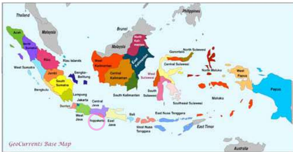
Figure 3. Map of the provinces of Indonesia showing the location of Parakan.

The designation of an area as historical is one that should be made by the local or central government. Indonesia, as a country with many islands and many historical areas, needs to make more effort towards preservation and conservation. One area which has many historical buildings and a significant character of its own is the city of Parakan. It is in the district in Temanggung and is a relatively unknown city as not all Indonesians know about it (see Figures 2, 3 and 4). However, in 2015 it was designated as a heritage city and since this classification many people have been eager to learn about its history and to explore it directly.