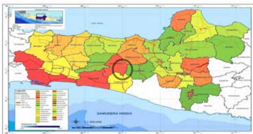
Figure 4. The Location of Parakan within the Island of Java.