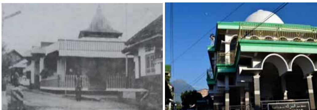
Figure 7. Mosque of Al Barokah Bambu Runcing - Left-hand Side: the mosque in colonial era before renovation, Right-hand Side: the mosque in post-colonial era after a major renovation. This mosque is one of the historical places during the colonial era for making sharpened bamboo as a traditional weapon to fight the Dutch.

One of the activities of KH Subuki and the Indonesian soldiers was to produce as much Bambu Runcing as possible. One of the rituals was to put both bamboo and soldiers in a pool of cool water together for 24 hours (the temperature in Parakan is always under 20 degrees). This tradition was intended to allow the soldiers to obtain strength from Allah SWT. The pool itself is located inside the Masjid Al Barokah. This is why the mosque is known as the Bambu Runcing Mosque. The mosque changed significantly from the colonial to the post-colonial eras. Before independence day, it had a traditional form with similarities of many Javanese mosques, with a pyramid roof known as a Limasan roof. Unfortunately, it did not remain as such, because in the 20th century its form was transformed, becoming more modern with a domed roof (see Figure 7).