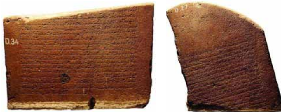
Figure 1. The Prasasti of Kayumwungan, there are only two pieces out of 5 remaining, D34 and D27. This Prasasti of Kayumwungan has been known as Prasasti of Karang Tengah as it was found in the Karang Tengah Village that today is known as Parakan.

Evidence for the existence of Parakan, which had been known as the Karang Tengah Village, is the existence of an inscribed stone named Prasasti Kayumwungan. Its inscription describes the history of the area in ancient Javanese and Sanskrit languages. This stone was found one hundred years ago in the Karang Tengah Village area and is proof of the existence of Parakan, which had been an area for all the rakai during the Mataram Kuno Hindu era. The Prasasti of Kayumwungan should consist of five pieces of stones with ancient Javanese inscriptions, but only two pieces remain (D27 and D34) (see Figure 1). This prasasti, also known as Prasasti Karang Tengah, can be found in the National Museum of Indonesia (Museum Nasional or Museum Gajah).