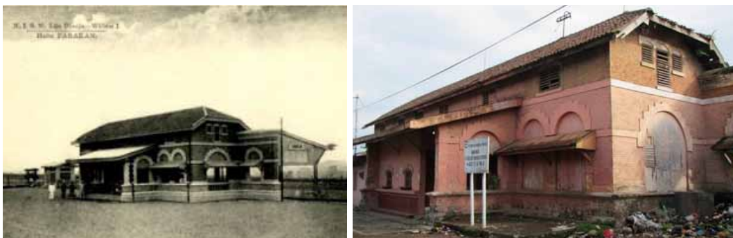
Figures 9. Old train station of Parakan, a historical building from the colonial era, it was the only rail station that brought all soldiers into to Parakan to meet KH Subkhi for Bamboo Runcing production.

In addition, there are also several buildings that represent the colonial era, such as the old railway station. This is from the 19th century, and its function was to bring goods from other cities in Java as Parakan was a well known trading hub in the colonial era. It was also the only station soldiers used to meet KH Subuki to make Bambu Runcing (see Figure 9). As shown, the building is in poor condition as it has been neglected for years, although its structure is still in good condition. This abandoned building should be well maintained and become a primary consideration for the local government.