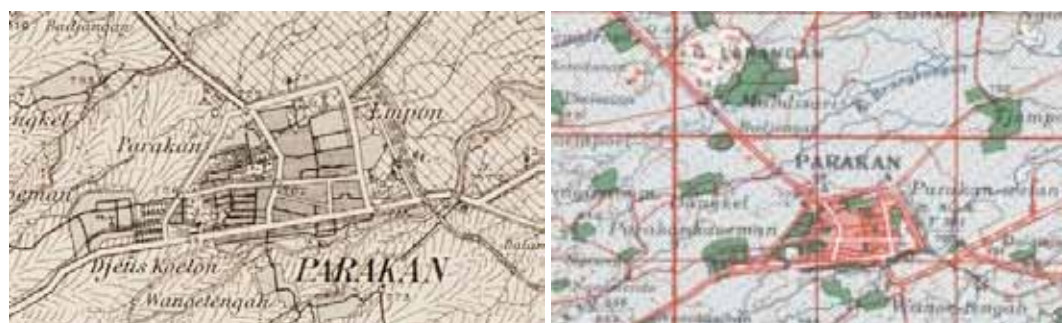
Figure 6. The Map of Parakan from colonial era to post-colonial era.