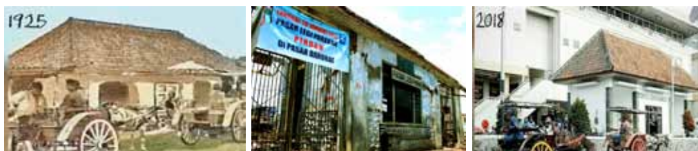
Figure 11. Pasar Legi Parakan is one of historical buildings in Parakan since colonial era in 1925 and it has been demolished and relocated in new place in 2014 and has been finished the construction in 2017. Source: left hand: KITLV (1925), middle: the abandoned Pasar Legi Parakan that had been demolished and relocated in a temporary place in 2013 and has been relocated in the new place in 2014 (Arcom Soekarno, 2013), right: Pasar Legi in its new location and has a semi modern traditional concept (private documentation, 2018).

Parakan, as a heritage city, has various landmarks, one of which is Pasar Legi Parakan (the traditional market of the city). It is called Pasar Legi because it used to operate only on Friday Legi (Legi is part of the Javanese calendar). It was built in the colonial era in 1925 and was only a small single building (see Figure 11) but also accommodated sellers at the front of the building. After years, the building was abandoned and lack of the utility as well as the structure and was finally demolished in 2014 and relocated. Construction of a new Pasar Legi Parakan building began in 2014; the concept of the market is a national standard, with a semi-modern yet traditional form.