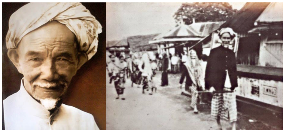
Figure 6a and 6b. The religionist and pioneer of the Bamboo Runcing, K.H. Subkhi, Kyai Bambu Runcing, National Hero of Indonesia and son of one of the soldiers of Pangeran Diponegoro.