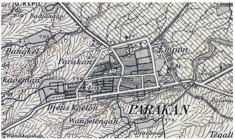
Figure 3. Map of Parakan in the Colonial Period (19th - 20th century)

culture of Parakan, which was known as the City of the Bamboo Runcing. The local community is very proud of the bamboo runcing and its history. It was introduced to Indonesian soldiers by the religionist K.H. Subkhi and became the traditional weapon of Indonesia. This historical aspect has led to emotional bonding and affection for this hero as a pioneer of the Bamboo Runcing. All members of the community of Parakan, whether native Indonesians, the Chinese community or "pendherek" or followers of Pangeran Diponegoro and their great-grand-children, have this historical attachment.