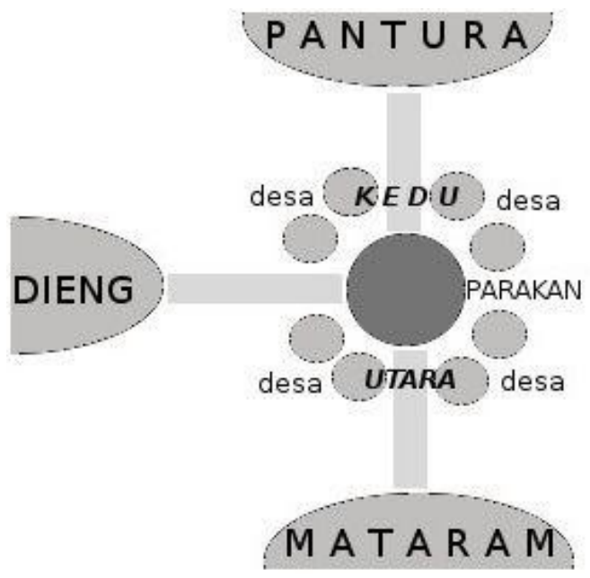
Figure 1. Location of Parakan in Central Java

Over time, Parakan has experienced significant physical and economic decline compared with surrounding cities. Its local government has been encouraged to restore it to its former glory through tourism by promoting its historical and cultural values. One of the most significant activities from the local community in collaboration with local government has been to propose Parakan as a heritage city, and the memorandum of understanding to this effect was declared and signed on 10<sup>th</sup> December 2015 by Bupati Temanggung and the Minister of Pekerjaan, Umum dan Perumahan Rakyat.