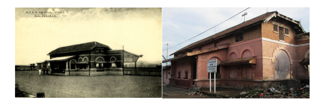
Figure 5a and 5b . Condition of the Railway Station in Parakan in the Colonial and Post-Colonial Periods.