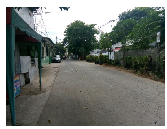
Figure 6. RW 05 office