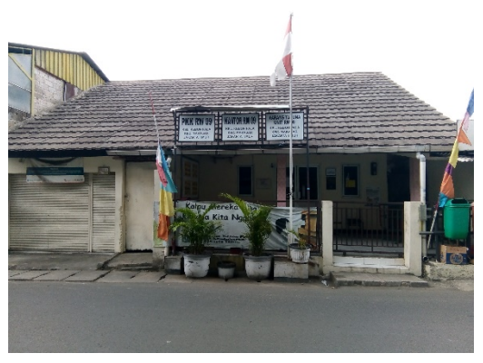
Figure 12. RW 09 office

by the surrounding community as well as cross-regional routes. This office is surrounded by several other building functions, including: Kebon Pala Primary School 03 Pagi, Kebon Pala Primary School 05 Pagi, Public Cemetery Park, and community business.