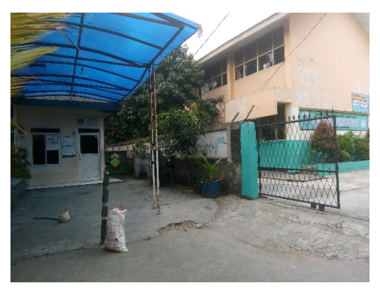
Figure 4. RW 04 office

This RW office starts operation from Monday to Friday at night. In the morning until late afternoon this office is not used. The building has a yard that is not so large and not fenced so anyone can access it. Therefore, this office actually has potential for the use of activities surrounding residents.