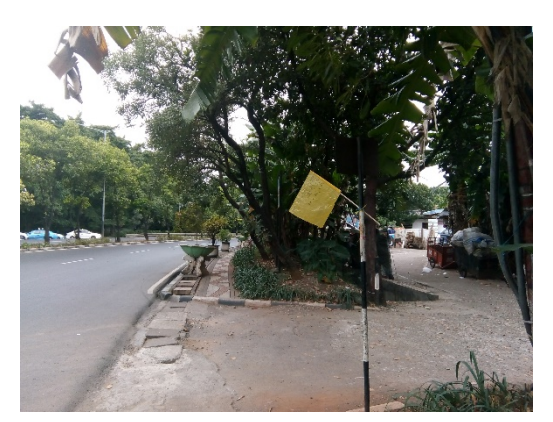
Figure 11. Access to RW 08 office is quite hidden

This RW office starts operation from Monday to Friday at night. In the morning until late afternoon this office is not used. The building has a fairly small yard and has a fence so it is not easily accessible by its citizens. Especially in the morning until this afternoon the office is not operational and the fence is closed.