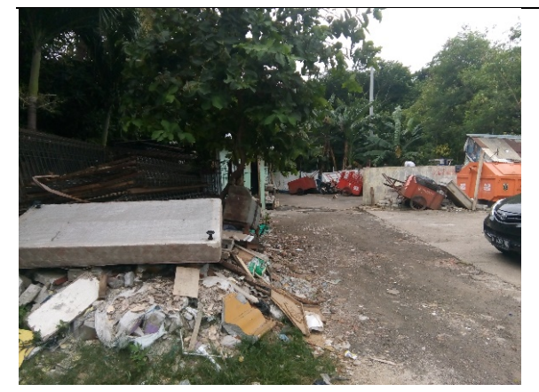
Figure 10. RW 08 office yard that seems slum