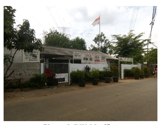
Figure 5. RW 05 office

Office of RW 05 is located at Jalan Permata. Access to the office is quite easy because it is located on a fairly wide road. The existence of this office is also quite easy to recognize because it is in the traffic lane citizens.