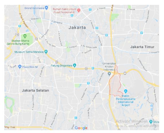
Figure 1. Location of Kelurahan Kebon Pala

Pala is located on Jalan Jengki. For this study only use 4 RW offices, namely: RW 04, RW05, RW 08, and RW 09.