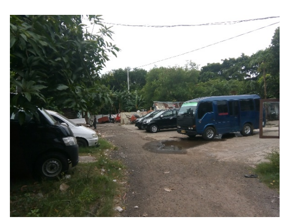
Figure 9. RW 08 office yard is used as a car care day (source: private documentation)