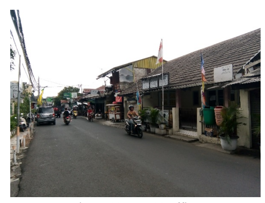
Figure 13. RW 09 office (source: private documentation)

This RW office starts operation from Monday to Friday at night. In the morning until late afternoon this office is not used. The building does not have a yard and is fenced so it is not easily accessible by its citizens. Especially in the morning until this afternoon the office is not operational and the fence is closed.