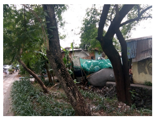
Figure 8. The existence of RW 08 offices are covered by illegal buildings