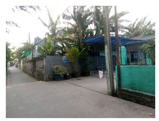
Figure 3. RW 04 office

can only be passed 1 lane four-wheel vehicle. The existence of his own office was quite remote, at the end of the road and flanked by the back wall of the office of the National Population and Family Planning (BKKBN) and State Elementary School (SDN) Kebon Pala 14 Pagi.