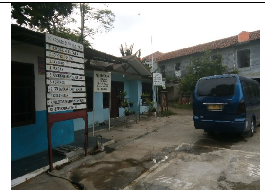
Figure 7. RW 08 office

RW 08 Office is located at Jalan Halim Perdanakusuma. Access to this office is actually a main road consisting of two paths separated by greening which is access to Halim Perdanakusuma Airport. However, the building was closed by the illegal building and storage place of environmental cleaners so it was not visible from the main road. Access to this office precisely through a small road that is quite difficult to reach by four-wheeled vehicles.