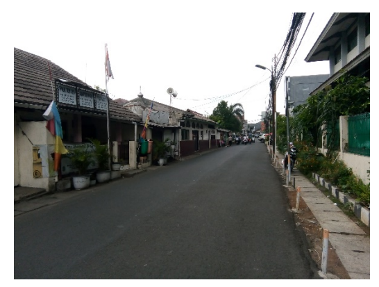
Figure 14. RW 09 office (source: private documentation)

There is not much citizen activity taking place in it. Only serve the administrative affairs of the citizens without any public activities.