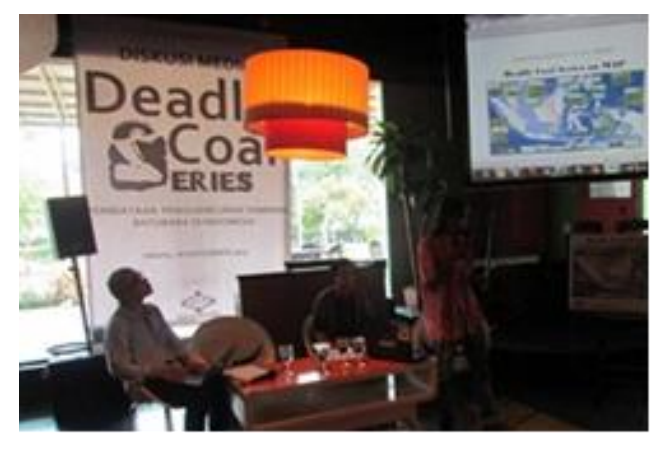
Figure. 01: Discussion activities in the Deadly coal Series

"...organize events to educate residents in the form of public discussion events by providing the message content from the process of the establishment of the mine to its activities, then there is an event called HATAM (Anti-Mining Day), activities involving taking to the streets and discussions..." (Interview with informant III, Juni 2021).