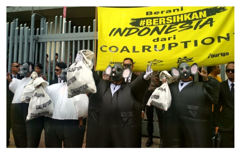
Figure. 02: Joint action to #BersihkanIndonesia from Coalruption by JATAM, Greenpeace and ICW

This part is quite interesting, it turns out that JATAM can collaborate with international NGOs such as Greenpeace, a well-known and credible social organization worldwide. Collaboration with these NGOs is a strength for the Deadly Coal campaign, providing numerous benefits. The first benefit is increased visibility of the campaign due to additional exposure of the campaign message to the public. The second benefit is the increased credibility of JATAM itself, as it is deemed trustworthy and receives support from international social organizations. These two benefits are considered to enhance the likelihood of the success of the Deadly Coal campaign. Previous research also explains that the coalition or collaboration among NGOs in these advocacy efforts is a study that has been extensively discussed in international relations. It is stated that the benefits of a coalition among NGOs are also referred to as an additional strength in advocacy efforts, meaning that a coalition serves as a strategy to facilitate the formation of new power networks based on the relationships among NGO supporters (Nwalie, 2019).