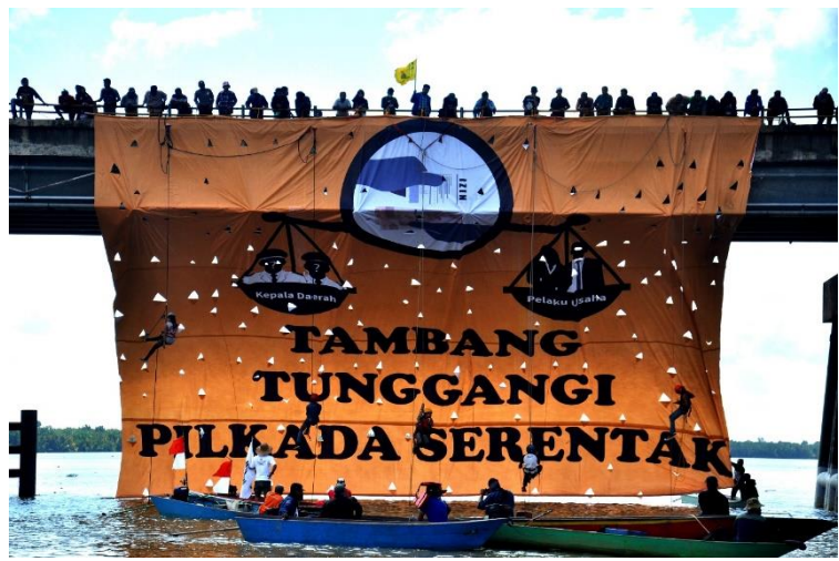
Figure. 03: The Jatam blockade action was entitled Mining for Simultaneous Regional Elections

The coal business is increasingly widespread because it is driven by political elites. Coal has even become a major source of political funding, both at the central and regional levels. In their advocacy during the Deadly Coal campaign, JATAM also joined the Anti-Mining and Palm Oil Mafia Coalition. They organized a blockade by placing banners on the Dondang River, which is typically a route for coal barge transportation in Muara Jawa, East Kalimantan, on this day. This action, involving communities affected by mining, symbolizes the resistance of the participants against illegal practices in politics during the simultaneous regional elections. It also condemns the government's policies that continue to rely on polluting energy sources such as coal and palm