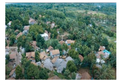
Figure 2. Map of Kuripan District

Assistance activities for cassava farmers are carried out during December 2021. Starting with the preparation of the team to Kuripan Village. At first, a small community service team consisting of 5 students went to Kuripan Village to conduct an initial survey of community needs. Furthermore, a large team of lecturers, staff and students held a FGD at the Village Office on December 18, 2021.